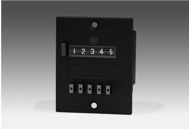
FS314 - front panel with screw mount