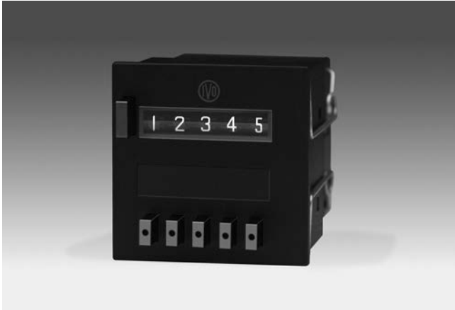
FS324 - front panel with spring clip mount